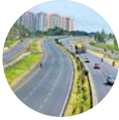
500 MTS FROM PROPOSED BYPASS