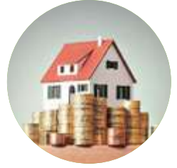
BANK LOAN FACILITY