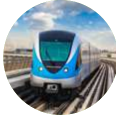
PROPOSED KOVILPALAYAM METRO STATION